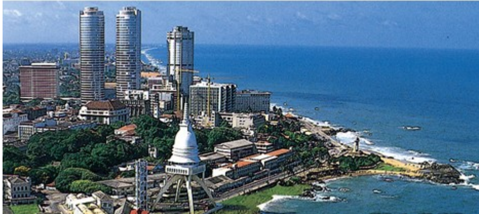
Aerial View Of Colombo