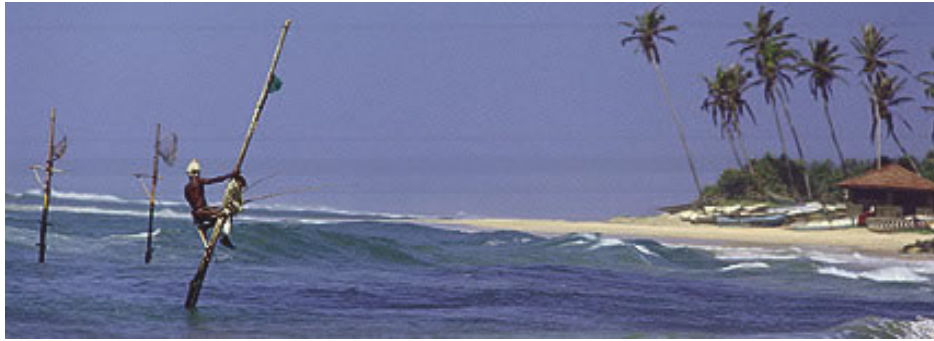
The South Coast Road