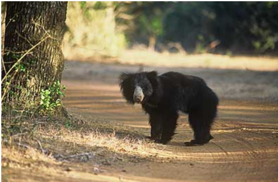
Sloth Bear At Yala

Yala is now gaining an international reputation as the best place to watch Leopards in Asia. It has the highest population density of Leopards in the world and is one of the few locations where they can be observed during daylight hours.