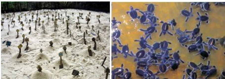
Turtle Hatchery And Baby Turtles