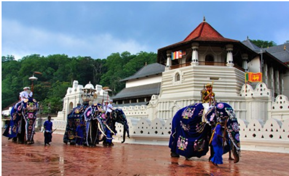
Temple Of The Tooth

The remarkable 'fortress in the sky'. A magnificent rock citadel with beautiful frescoes hidden in a natural cave dating from 470 A.D. The climb to the top from the huge stone Lions Paws is a dizzying experience with superb views over surrounding forests and distant hills. The newly excavated Royal Pleasure Gardens at the foot of the rock are some of the earliest from antiquity. Thought by many to be the 8 th Wonder Of The Ancient World!