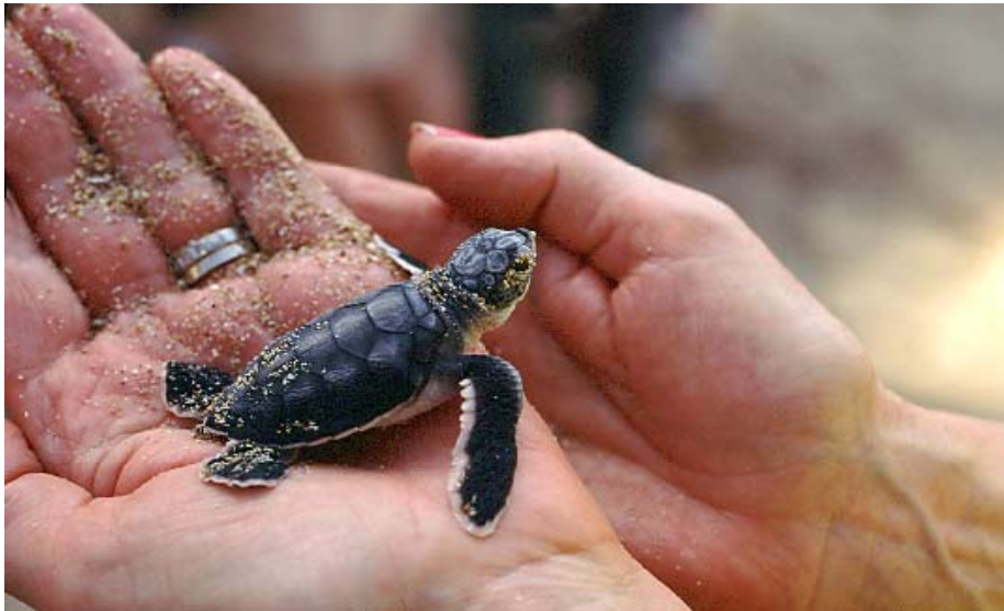
Baby Turtles At Kosgoda Hatchery

Here you may see baby turtles that are conserved for release into the ocean at an important turtle-nesting beach. Turtle eggs are collected from nearby beaches and hatched in large tanks. Depending on the time of day, it may be possible for you to release a handful into the ocean and watch them disappear with the breaking waves.