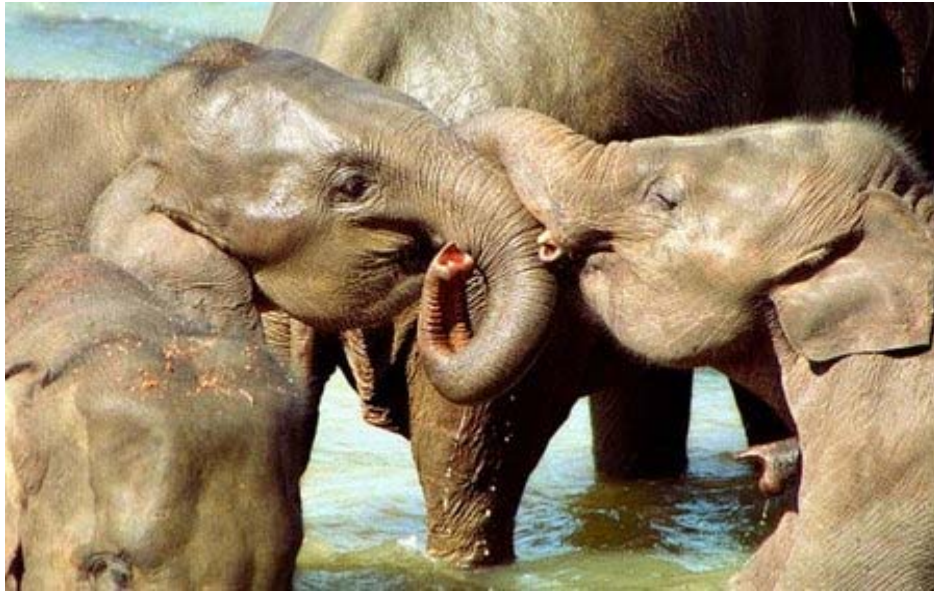
Pinnawela Elephant Orphanage