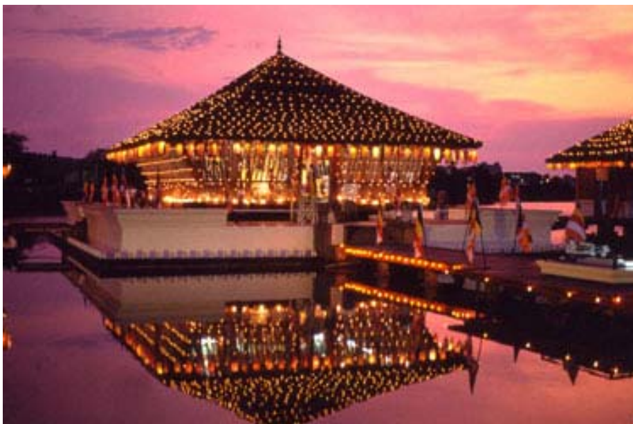
Temple On Beira Lake