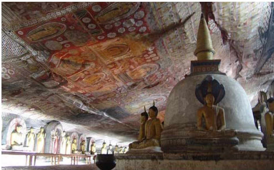
The Golden Cave Temple At Dambulla

See their website: http://www.millenniumelephantfoundation.com/