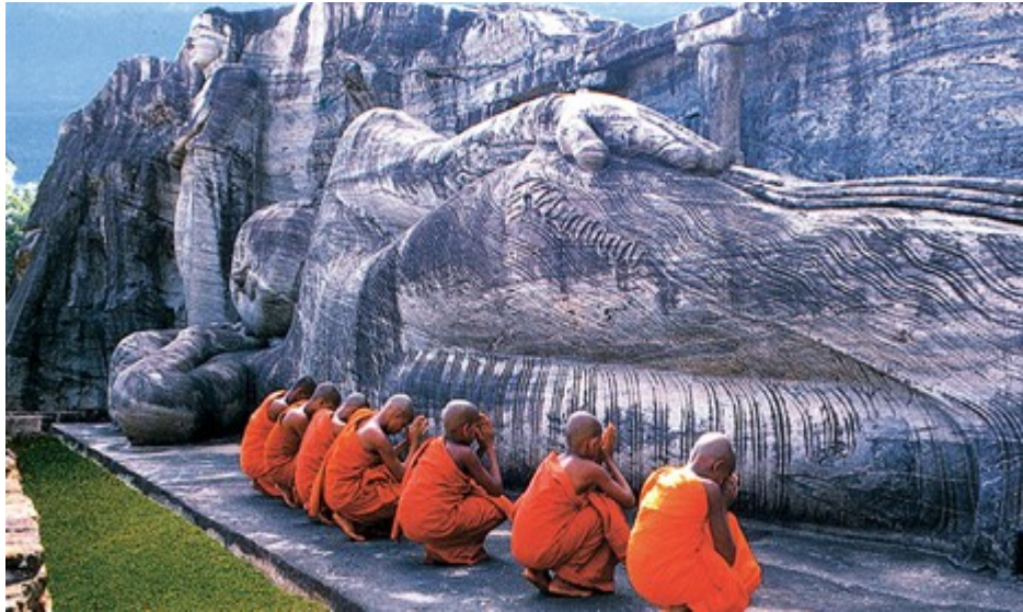
Gal Vihare Sculptures At Polonnaruwa