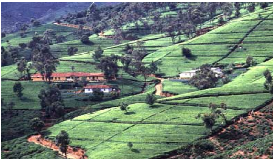
Tea Estates Near Nuwara Eliya