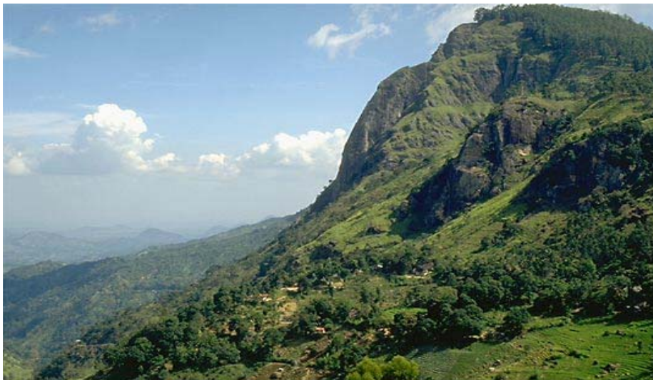
Hill Country Near Nuwara Eliya

Tea estates cover the mountains of the island in a vast expanse of green as far as the eye can see. Legendary Hill Stations of the British tea planters who came to Ceylon, as it was then known include Nuwara Eliya and Bandarawela. Amazing views from the southern escarpment of the Uva Hills can be experienced at Haputale and Ella.