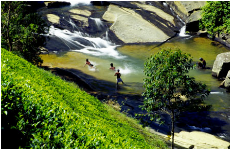
Idyllic Tea Estates And Waterfalls At Ella

The area around the spectacular 'Ella Gap' is a great place for walking and relaxation. The well known Ravana Ella Waterfall is one of the most beautiful in Sri Lanka.