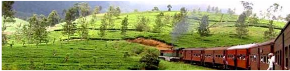
Hill Country Express