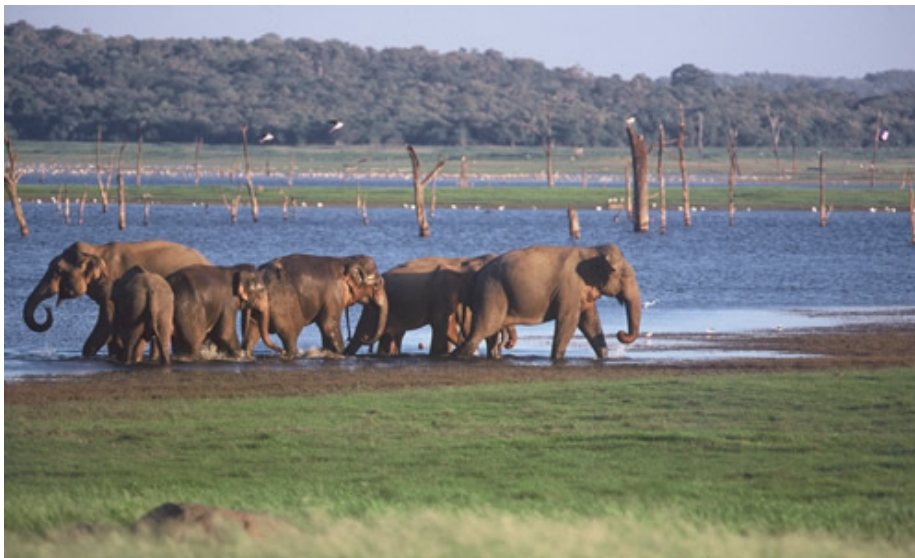
Elephants At Minneriya Lake

The capital of medieval Sri Lanka from 11 th -14 th Century contains ruins of stupas, temples and monasteries, which are still excellently preserved. The Gal Vihare with 3 huge rock-cut images of the Buddha is one of the world's great works of Buddhist sculpture.