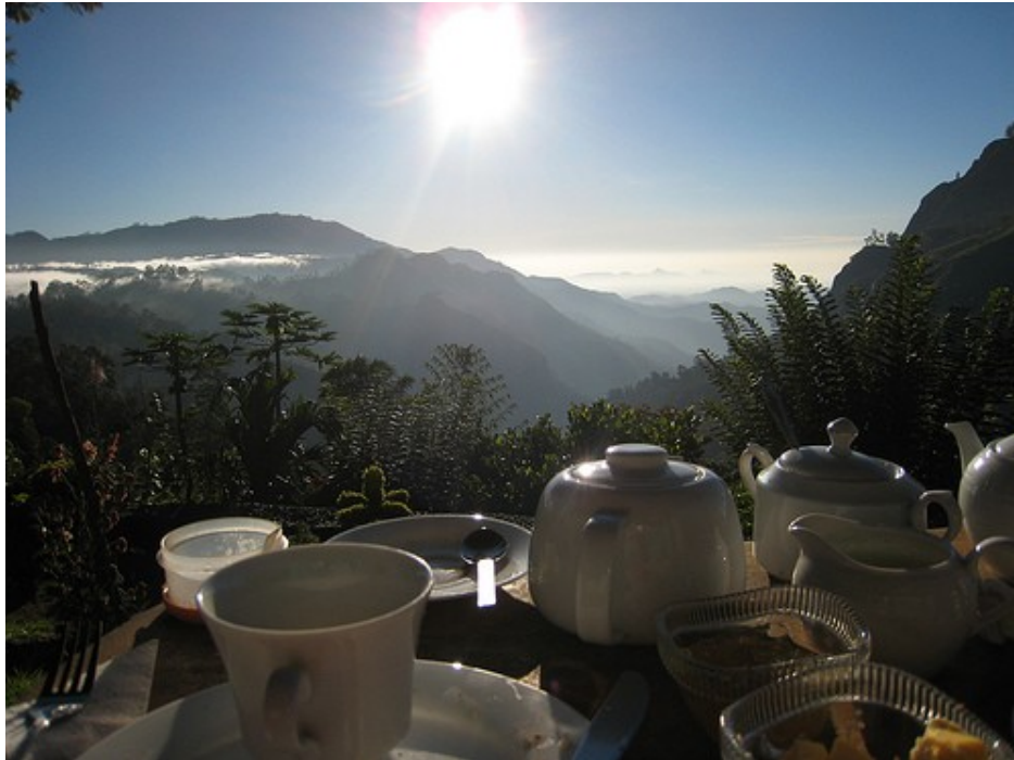
Tea Overlooking The Ella Gap