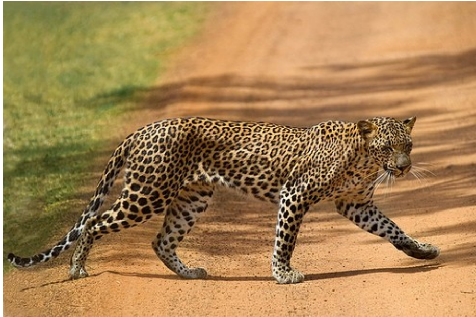
Leopard Crossing Road At Yala