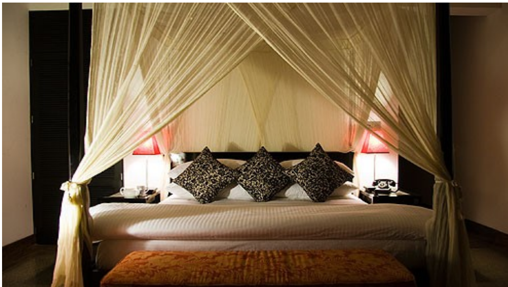
Bedroom At The Wallawwa

A 'wallawwa' is typically an old manor house with architectural features of columns, courtyards and verandahs. It has an interesting history that dates back to the mid 17th century when it was owned by a head chieftain of Galle . This colonial bungalow has been lovingly restored maintaining its old world charm with a blend of luxurious comforts and stylish design.