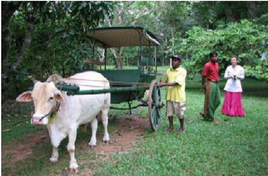
Bullock Cart Ride

A luxurious boutique hotel with easy access to Colombo Airport . The old British colonial period mansion is located in the middle of a vast coconut and spice estate. You can go on a tour around a plantation that is full of Pepper, Cloves, Vanilla , fruit trees and paddy fields.