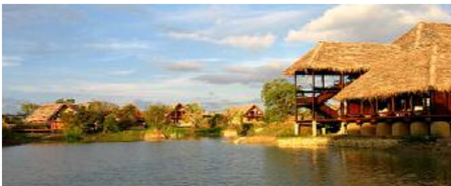
Restaurant At Vil Uyana

Vil Uyana is Sri Lanka's most in-demand luxury property. A man made matrix of wetland and organic paddy fields studded with luxurious Bali-inspired dwellings and an island spa, in the culturally rich north central plains near the famous rock fortress of Sigiriya .