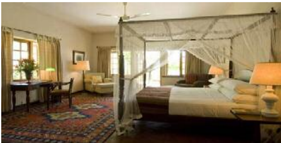
Tea Trails Norwood Bungalow Bedroom

Colonial period tea estate bungalows located at over 5000ft above sea level. You can walk among tea bushes and wander around the surrounding tea estate. Each bungalow has a series of luxury rooms and suites with a full compliment of staff including internationally trained master chefs.