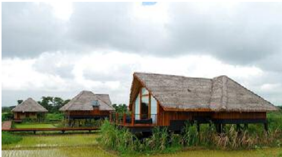
Vil Uyana Paddy Field Villas

The capital of medieval Sri Lanka from 11 th -14 th Century contains ruins of stupas, temples and monasteries, which are still excellently preserved. The Gal Vihare with 3 huge rock-cut images of the Buddha is one of the world's great works of Buddhist sculpture.