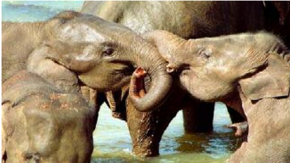
Pinnawela Elephant Orphanage