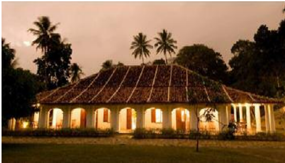
The Kandy House

The remarkable 'fortress in the sky'. A magnificent rock citadel with beautiful frescoes hidden in a natural cave dating from 470 A.D. The climb to the top from the huge stone Lions Paws is a dizzying experience with superb views over surrounding forests and distant hills. The newly excavated Royal Pleasure Gardens at the foot of the rock are some of the earliest from antiquity. Thought by many to be the 8 th wonder of the ancient world!