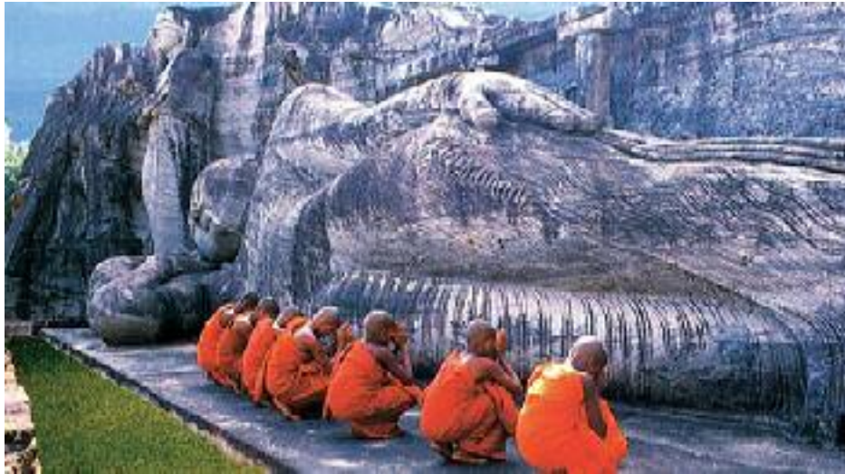
Gal Vihare Sculptures At Polonnaruwa