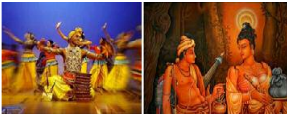
Kandy Temple Dancers And Paintings At Temple Of The Tooth

One of the finest botanical gardens in the East including an Orchid House with 300 varieties. Lord Mountbatten's South East Asia Command Headquarters were located here during WW 2.