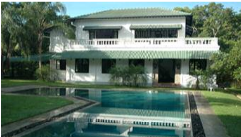
Beautiful Horathapola Estate