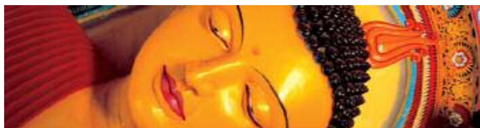
Reclining Buddha At Kandy