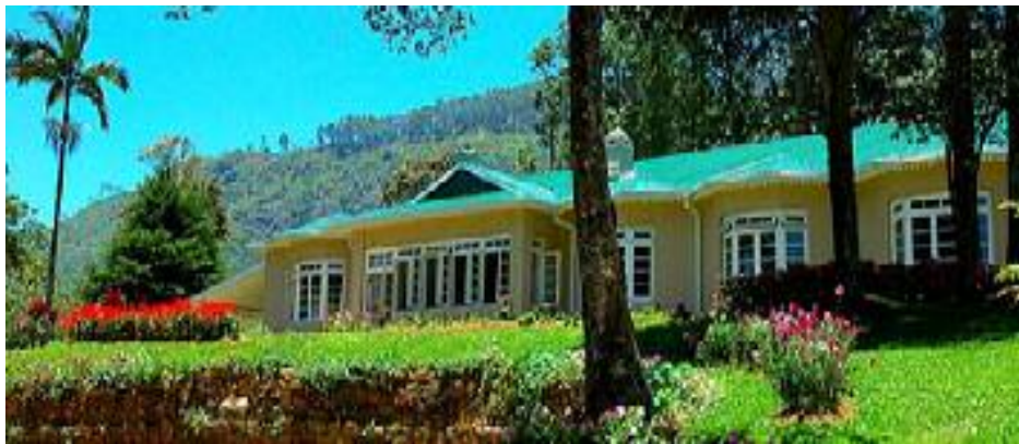
Tea Trails Castlereigh Bungalow

A picture postcard landscape of tea gardens and mist laden hills with the lovely Castlereigh Lake surrounded by pine trees dominating the valley below.