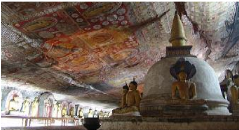
The Golden Cave Temple At Dambulla

Set in a pretty riverside location, this is home to about 70 Elephants - the largest group of orphaned Elephants in the world! Most have been found injured or abandoned in the wild. Baby calves, some only a few weeks old are fed by bottle and the whole herd is then bathed in the adjoining river. A tour highlight for many visitors to Sri Lanka .