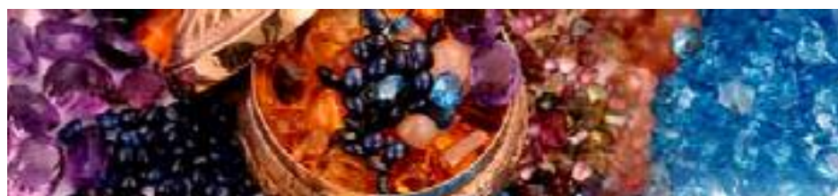
Sri Lankan Gemstones