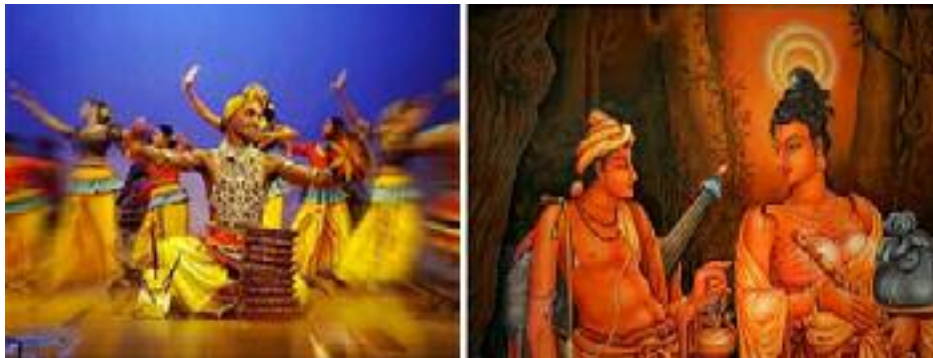
Kandy Temple Dancers And Paintings At Temple Of The Tooth

Set in a pretty riverside location, this is home to about 70 Elephants - the largest group of orphaned Elephants in the world! Most have been found injured or abandoned in the wild. Baby calves, some only a few weeks old are fed by bottle and the whole herd is then bathed in the adjoining river. A tour highlight for many visitors to Sri Lanka .