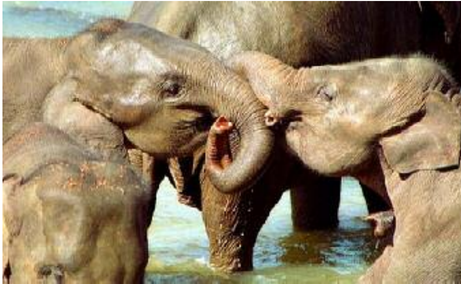
Pinnawela Elephant Orphanage