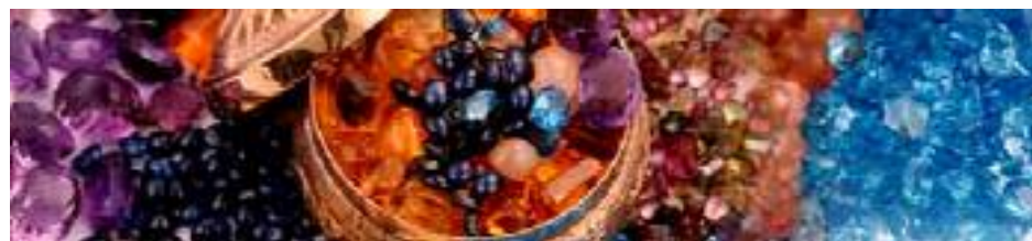
Sri Lankan Gemstones