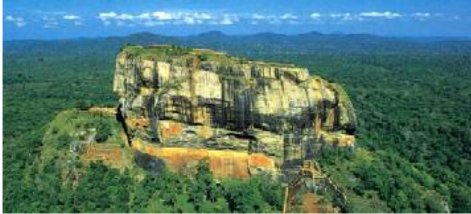
Sigiriya Rock Fortress