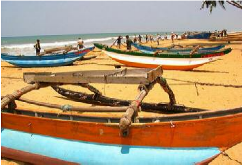
Fishermen At Kalutara Beach