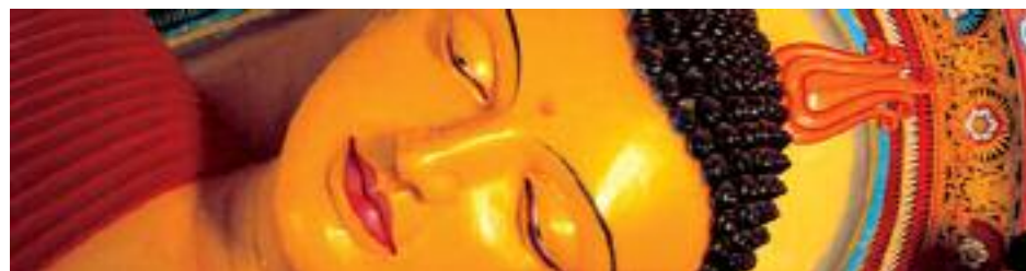
Reclining Buddha At Kandy