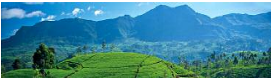
The Beautiful Bogawantalawa Valley