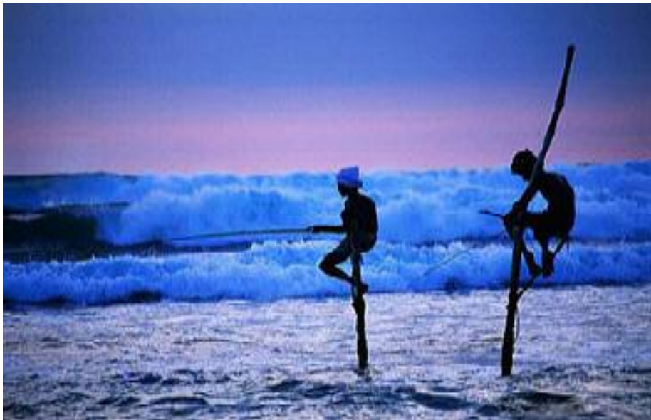
Sri Lanka's Famous Stilt Fishermen

The popular beaches of the South West of the island are to the south of Colombo . These include Wadduwa and Kalutara , with a long sandy beach and the famous Bentota Beach further to the south with numerous picturesque bays and coves.