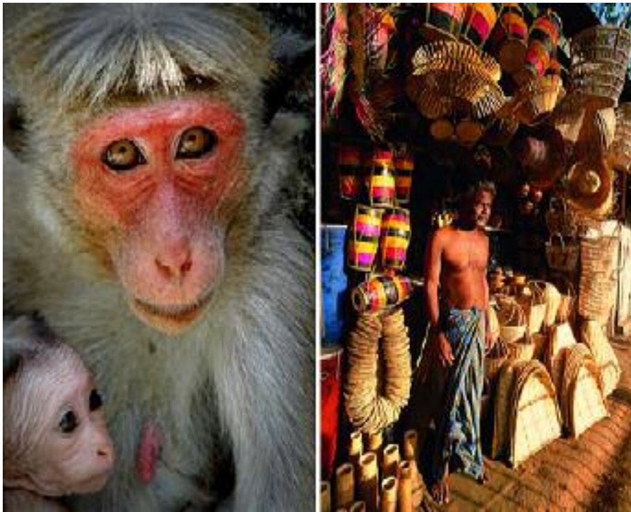
Monkeys And Basket Shop At Dambulla

Dambulla lies at the heart of Sri Lanka 's Cultural Triangle and was the centre of the island's great ancient civilization that flourished over 2000 year ago. Today the Dambulla – Habarana resort area has some of Sri Lanka's finest hotels, located in very beautiful forested surroundings. Many have fine views of the world famous Sigiriya Rock Fortress .