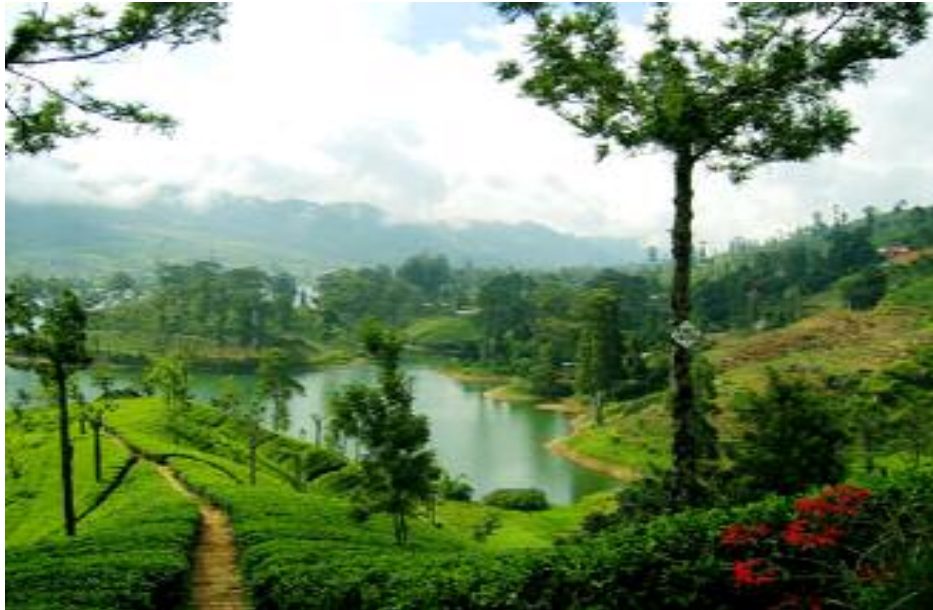
Sri Lanka's Sublime Hill Country