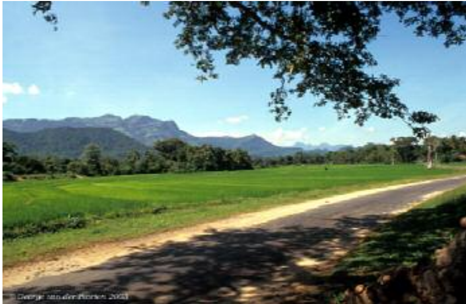
Landscape On Way To Dambulla