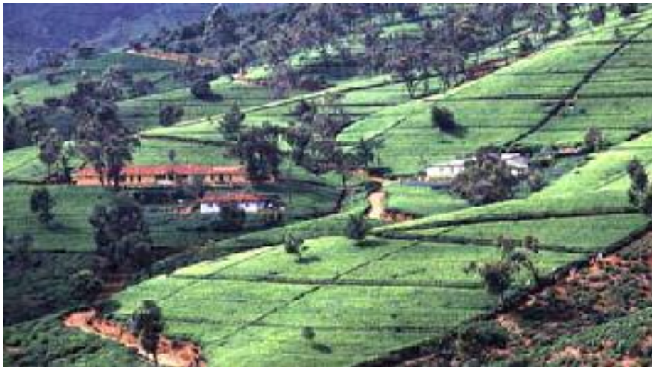
Tea Estates Near Nuwara Eliya

The original Hill Station of the British tea planters who came to Ceylon , as it was then known. There is a Hill Club , Grand Hotel , the oldest Golf Course in Asia and even a Race Course - all are bygone reminders of an English social life that once thrived here.