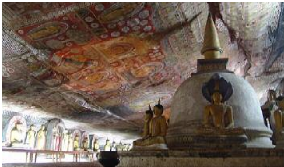
The Golden Cave Temple At Dambulla

The remarkable 'fortress in the sky'. A magnificent rock citadel with beautiful frescoes hidden in a natural cave dating from 470 A.D. The climb to the top from the huge stone Lions Paws is a dizzying experience with superb views over surrounding forests and distant hills. The newly excavated Royal Pleasure Gardens at the foot of the rock are some of the earliest from antiquity. Thought by many to be the 8 th Wonder Of The Ancient World!